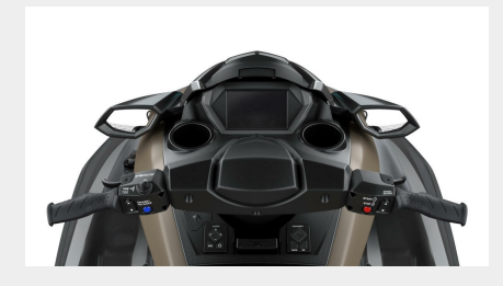
RiDE® system (Reverse with intuitive Deceleration Electronics)

The capable hull of the FX HO model cuts through the water, providing stability on any trip. Impressively rigid and robust, it gives these machines awesome on-water performance with stunning acceleration, high top speed, great economy and an even more comfortable ride.